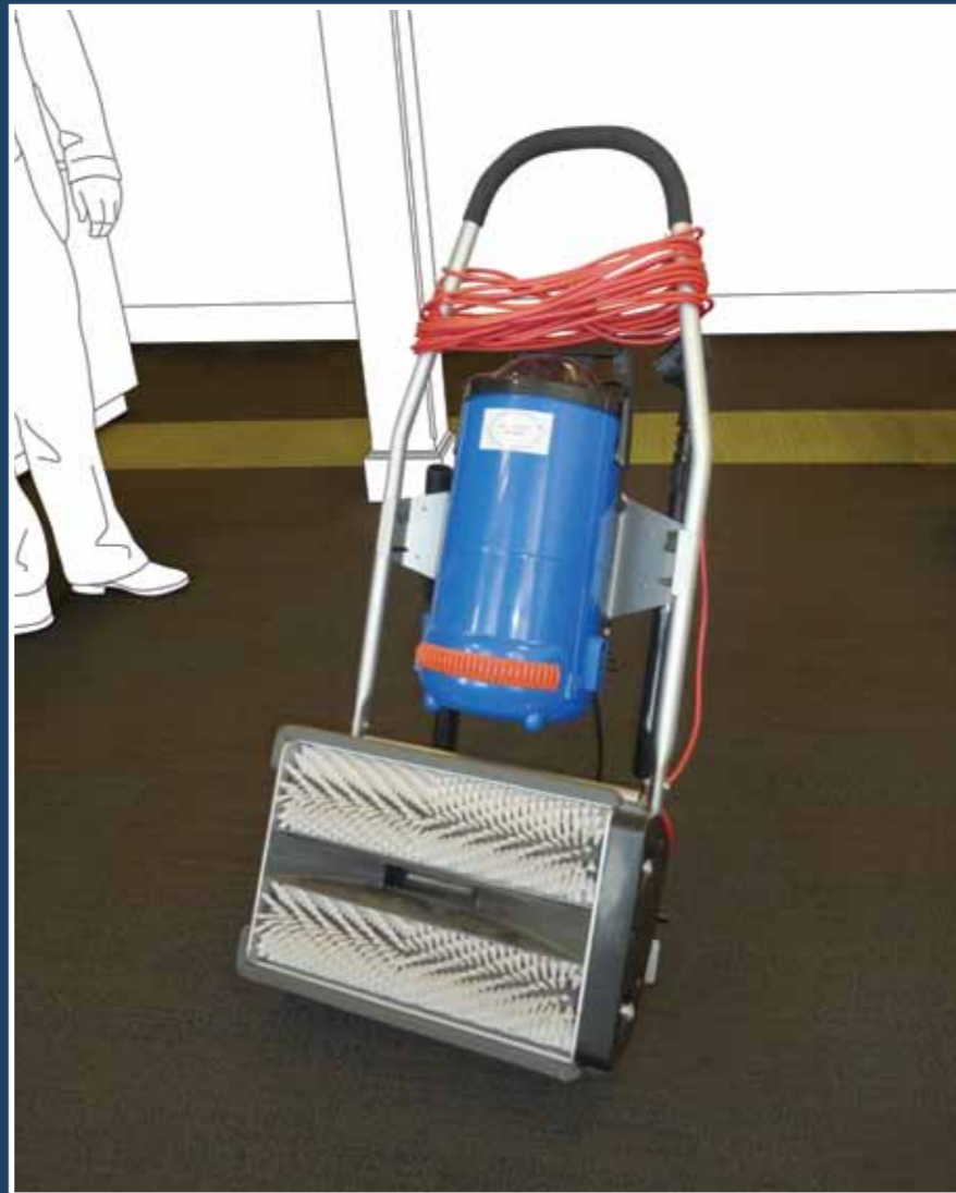
Pile lifting machine

NB: Pile lifting should not be carried out on Flor S, Superflor or any other needlepunched carpet. Nor should it be carried out on Elevation II, Made To Measure, Precious Ground, The Scandinavian Collection, Straightforward or any other microtuft product.