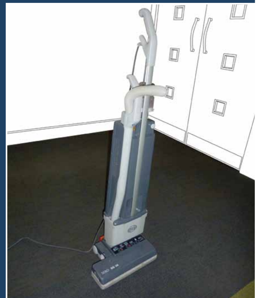
Example – recommended vacuum cleaner

Note: For Flor S, Superflor and any other needlepunched carpet with a pile or structure, a suction only vacuum cleaner should be used.