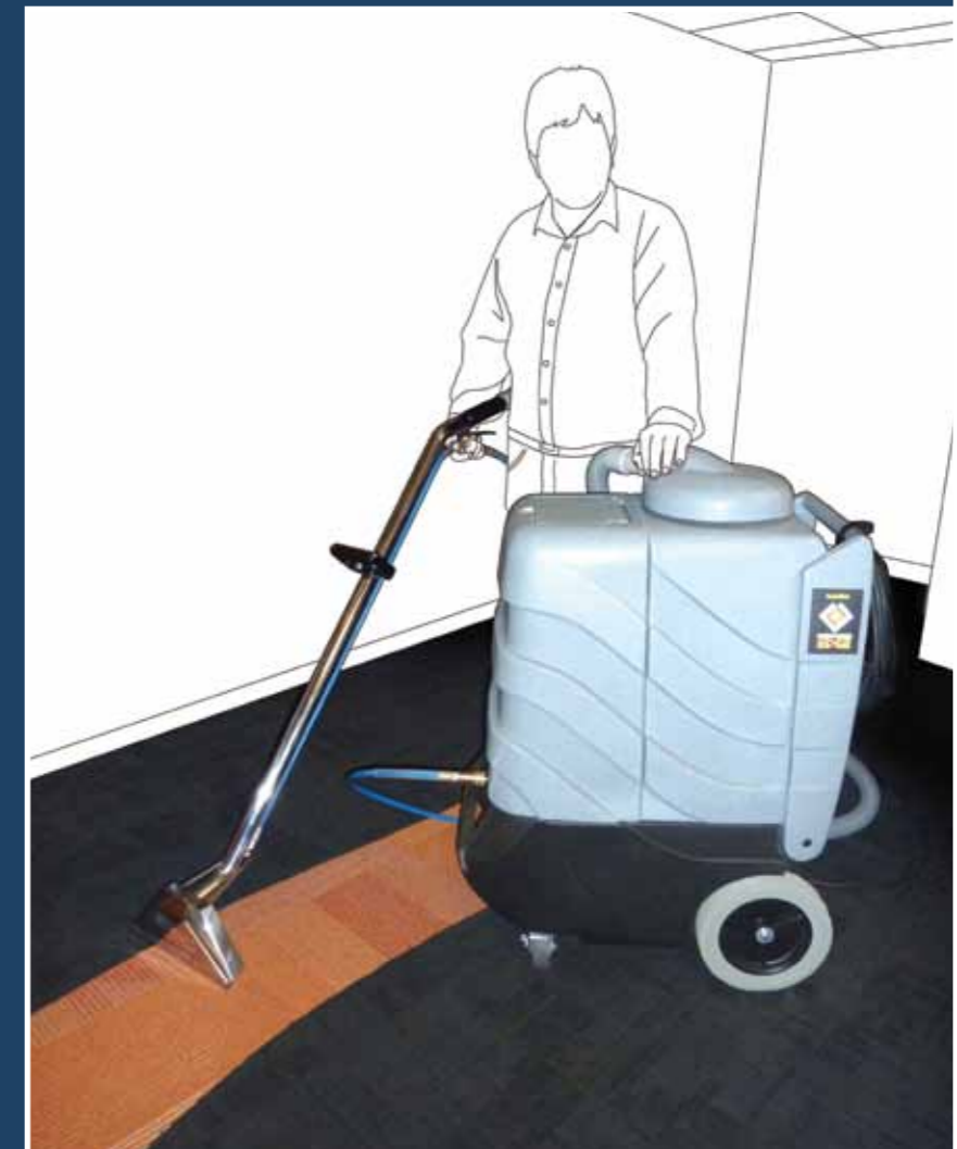
Hot Water Extractor

Note: For Flor S, Superflor and other needlepunched products, hot water extraction and vacuum cleaning are the only recommended maintenance methods.