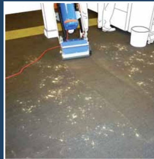
Dry extraction process