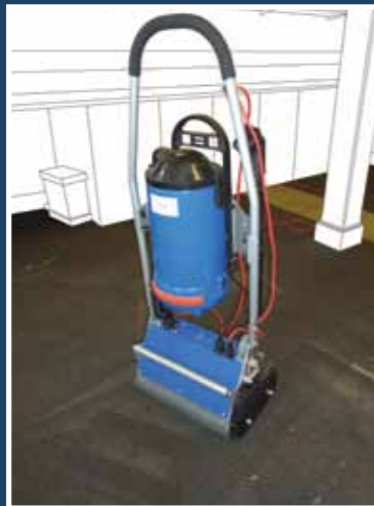
Dry extractor (pile lifter)

Time should be allowed for the solution to dry and form the encapsulating crystalline formations around the fibre which effectively trap any soils and other contaminants. Drying time will vary according to several factors including humidity, air flow and ambient temperature, but it can be expected to be anything from 60 minutes. Once it is dry the area can be vacuum cleaned and pile lifted.